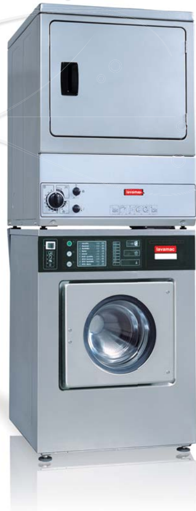
LA 60 75